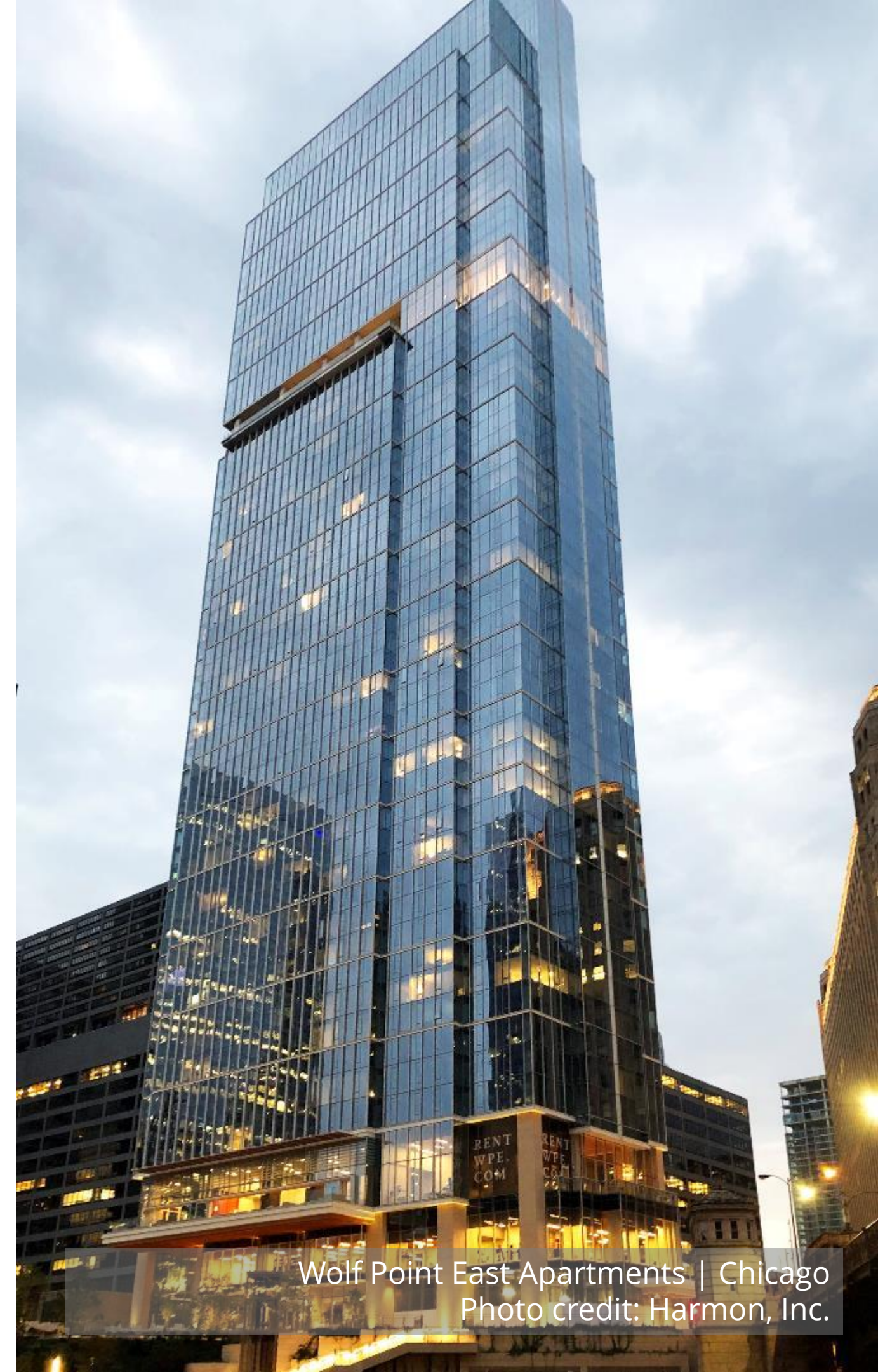
Wolf Point East Apartments | Chicago